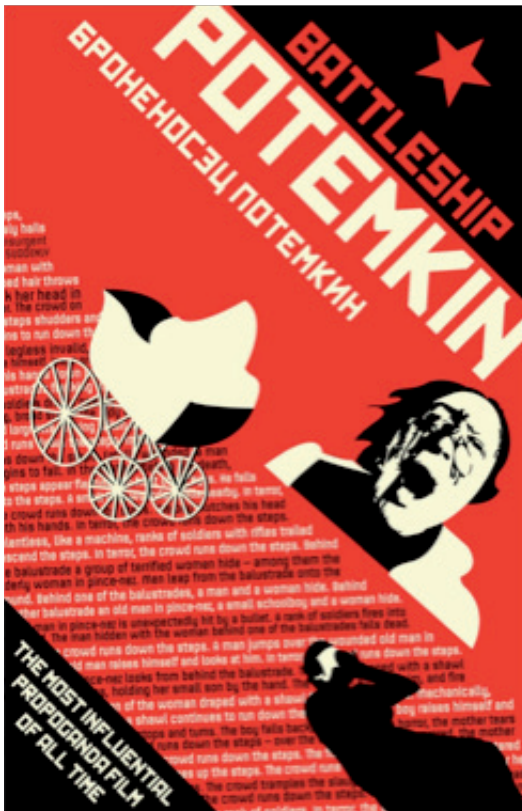
▪ Fig.1. Andrew James Stratton: Battleship Potemkin Type Poster (2011) - Part of an ongoing series of typographic posters dedicated to international silent films from the early 20th century. http://s3images.coroflot.com/user_files/individual_files/original_365239_VLYE_ASVLqa8l5hcDFmjy-wBHC.jpg (22.2.13)