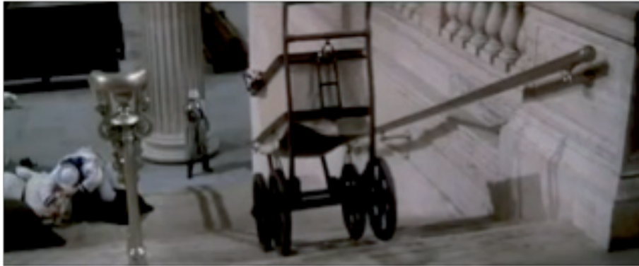
▪ Fig.5. Brian de Palma: The Untouchables (USA, 1987).