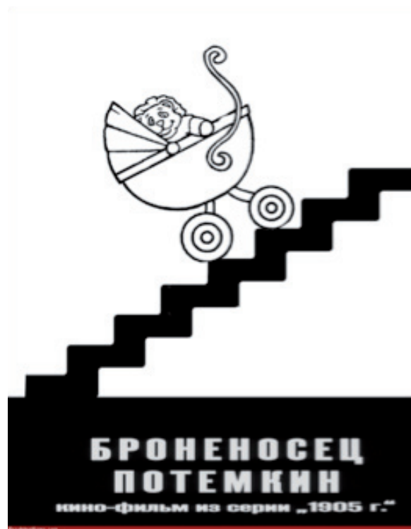
▪ Fig.6. Brian de Palma: The Untouchables (USA, 1987).