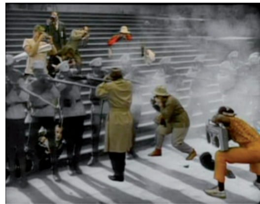
▪ Fig.2. Screenshot from Zbigniew Rybczyński: Steps (USA, 1987) http://www.videoex.ch/videoex2012/admin/downloads/142_steps_rybczynski_videoex.jpg (22.2.13)